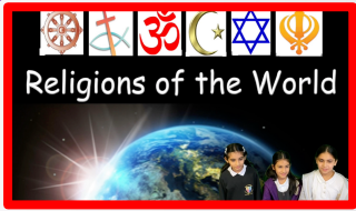
Religions of the World