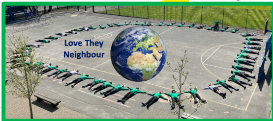
Year 6 at Bishop Bridgeman demonstrating love for each other around the world.