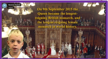
On 9th September 2015 the Queen became the longest-reigning British monarch, and the longest-reigning female monarch in world history.