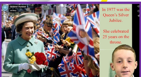
In 1977 was the Queen's Silver Jubilee. She celebrated 25 years on the throne.

* Use the window, mirror and door technique to reflect on service and leadership.