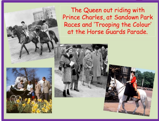
The Queen out riding with Prince Charles, at Sandown Park Races and 'Trooping the Colour' at the Horse Guards Parade.